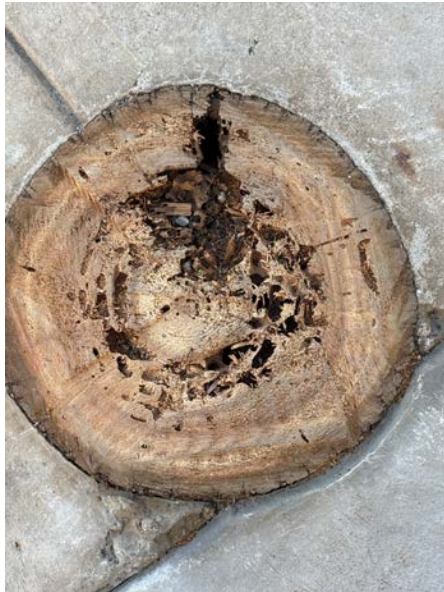
Old wood pole showing The rotting interior