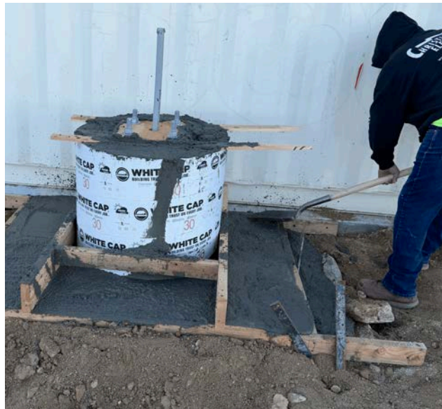
Concrete base for new, metal light poles