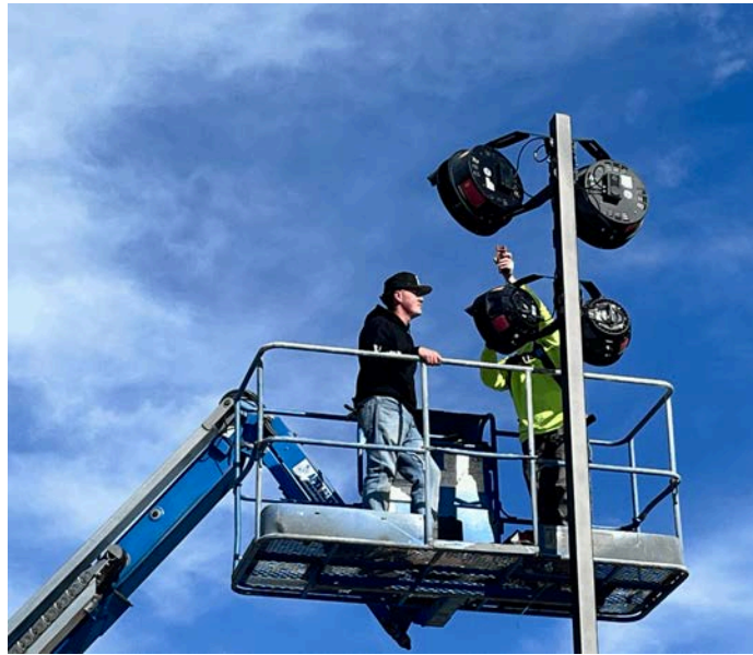
Old lights being installed on new poles