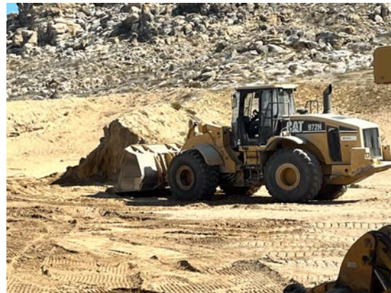
Work begins to remove one of the two center berms on Pistol 1